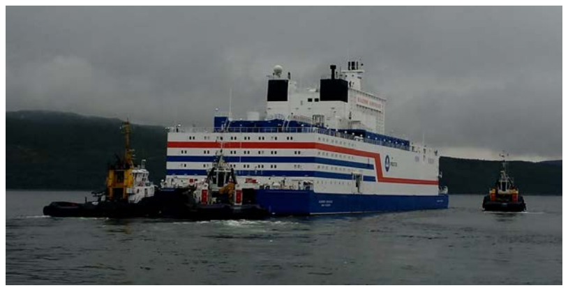
Figure 5.- The floating nuclear power plant Akademik Lomonosov being towed to the Chukotka district in 2019. https://upload.wikimedia.org/wikipedia/commons/d/d1/ Akademik Lomonosov 20190823%2C cropped.jpg

1-5 MW SMR, with new scientific and technological advances, intrinsically safe and capable of withstanding external attacks while requiring a smaller exclusion zone. It is likely to be operational by the end of 2023 and tested in 2024. According to the SCO Director, the large-scale production of a Generation IV nuclear reactor will have significant geopolitical implications for the United States. "The Pele Project offers a unique opportunity to further advance energy resilience, reduce CO2 emissions, while increasing nuclear safety and non-proliferation standards at advanced reactors around the world," he said.