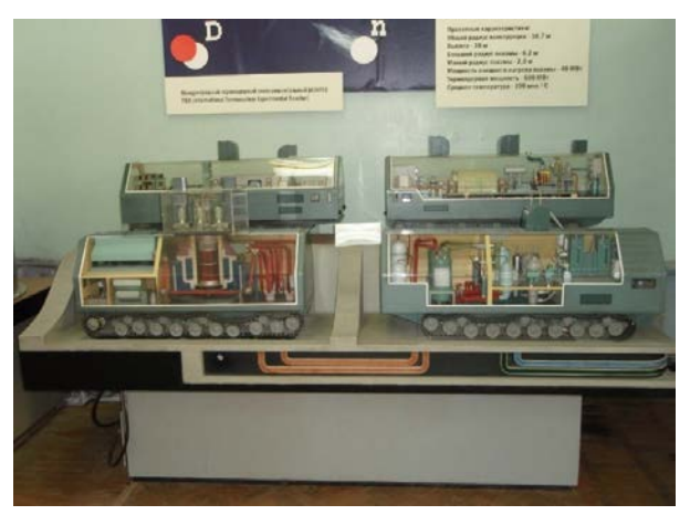
Figure 2.- Mock-up of a mobile nuclear power plant at the Moscow State Polytechnic Museum. <a href="https://commons.wikimedia.org/wiki/File:Model">https://commons.wikimedia.org/wiki/File:Model of a mobile nuclear power plant.jpg</a>

The American ML-1 and the Soviet TES-3 were the beginning of small modular reactors to be included in future programmes. They could travel on all types of transporters: ships, planes, trains and trucks, over rough terrain that does not allow the use of conventional power supply systems. Once installed, the plant was fully operational after about twelve hours. ML-1, equipped with a gas-cooled reactor (GCRE), was included in the US Army Nuclear Power Program and could generate power equivalent to burning 1.5 million litres of gasoline. However, due to initial mechanical problems with cooling, faulty sensor readings and other problems, the programme was shut down in 1965.