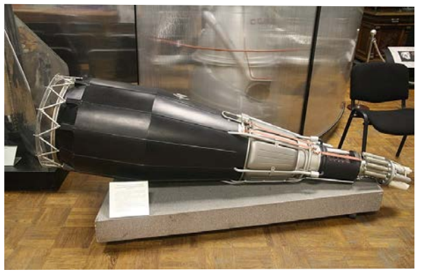
Figure 3.- Mock-up of the SMR TOPAZ. Moscow Museum of orbit in the 1970s. Technology.

sentences in the Soviet GULAG, wrote universal pages in the history of engineering.