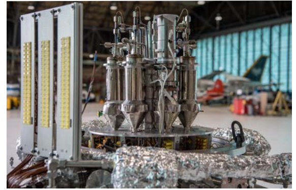
Figure 4.- Prototype 1 kW Kilopower nuclear reactor for use on space and planetary surfaces.

Technology (KRUSTY), a fully automatic SMR designed to operate for decades in remote or hostile locations: on spacecraft; on the Moon or Mars. KRUSTY led to Megapower, with additional safety innovations in the event of reactor core failures. Each Megapower unit produces about 10 megawatts of electricity.